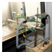
KI DISCUSS TEST